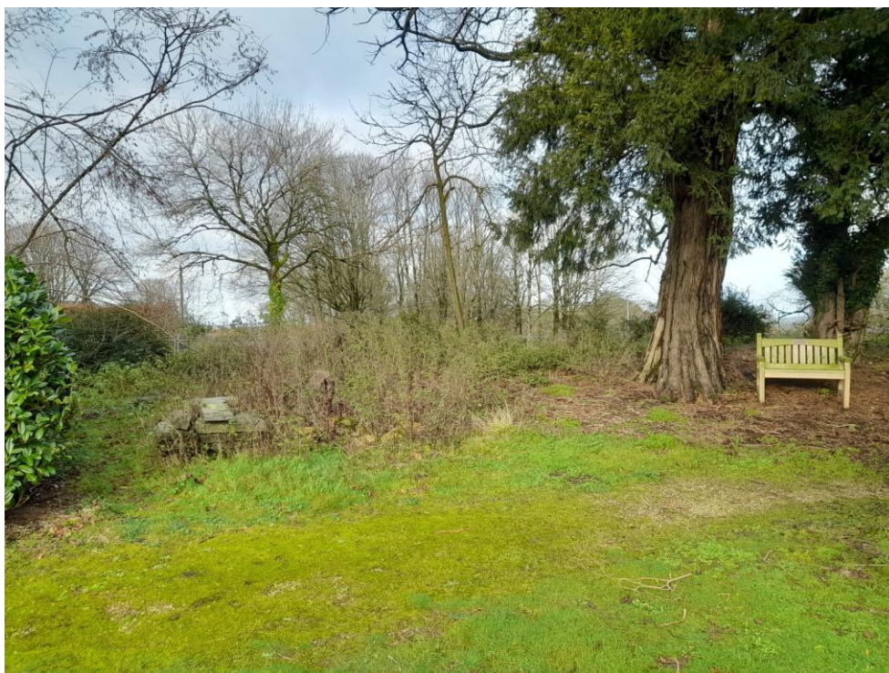
Section 3 – 15 metres

Three suppliers have been approached for quotations. While Supplier A offers the lowest cost for smaller plants, Supplier B consistently provides the most competitive pricing for the larger plant option across all sections.