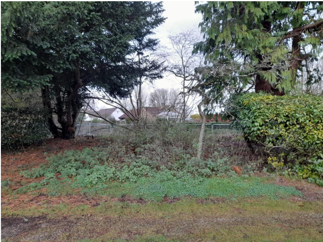
Section 2 – 6 metres