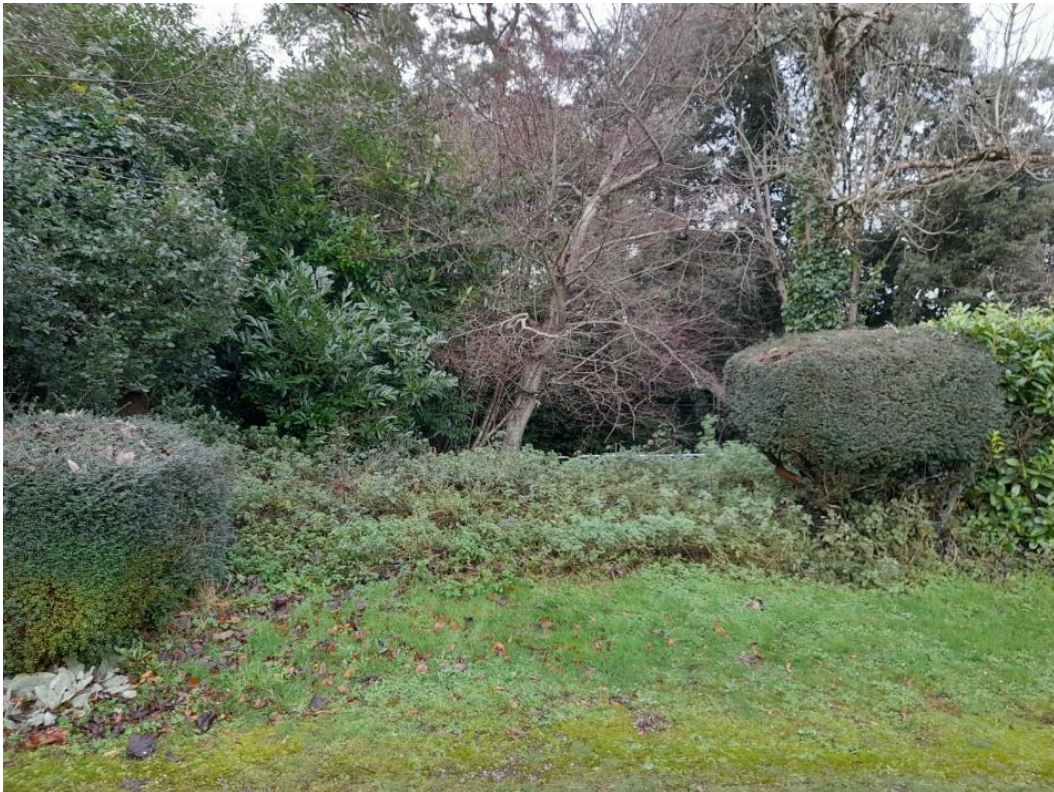
Section 1 – 4 metres