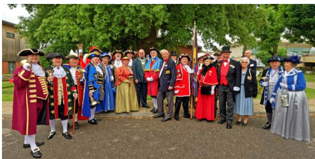
2016 Town Crier Competition

We are hoping that the tug of war competition will make an appearance again this year, along with other activities to make this a fun family day out.